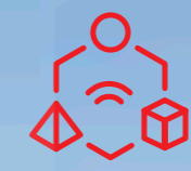
Internet of Elevators and Escalators